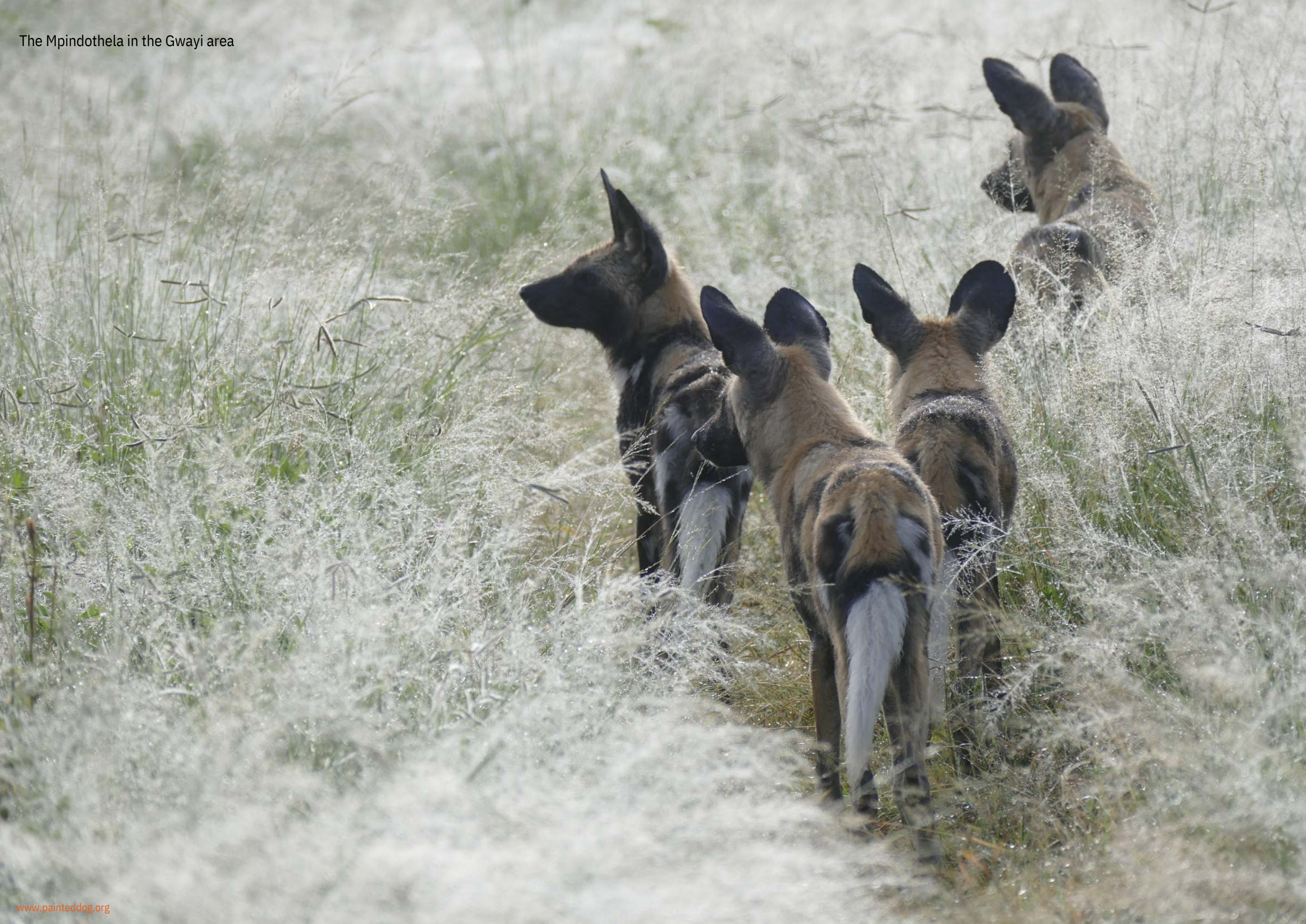
The Mpindothelela in the Gwayi area